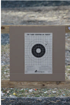
The Right Way

To prevent shooting out (destroying) the wood cross beams.