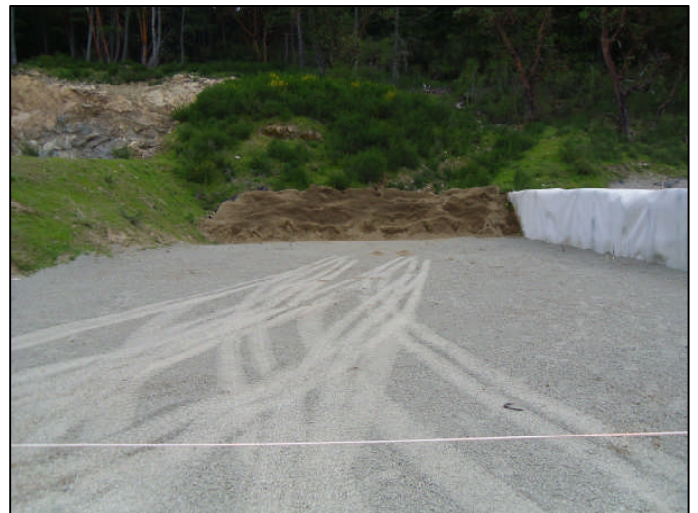
Figure 1 - New Bay 8 - Weekend Use ONLY!!

You will notice that we have also started to construct 3 more bays to the south (right side) of Bay #1. While the berms have been half-built, there is still blasting & sculpting that needs to be done to these bays before we have an approval for use. Please DO NOT use these bays while they are under constructions. If all goes well, we hope to have them ready for use later in the summer, or early fall.