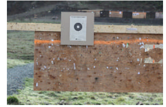
The Wrong Way

The Wood cross pieces in theory should not have any holes in them, We are going through a lot of wood unnecessarily. Please make sure targets are placed correctly and educate other members if they haven't read the Newsletter.