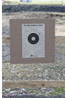
The Wrong Way