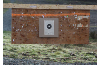
The Right Way