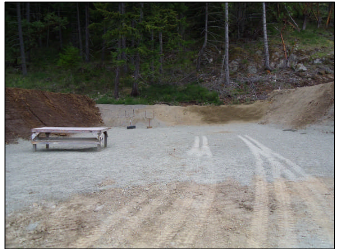
Figure 1 - Updated Bay 1

Bay #2 has also been made wider, and the rear berm has been spruced up a bit.