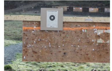
The Wrong Way