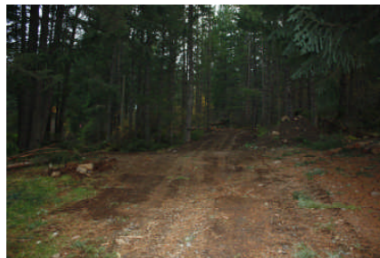
New Access road to the New Property