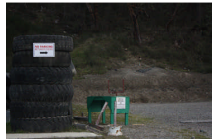
75 New / Replacement signs are being installed. (No Parking in front of the Bays at the Multi-Purpose anymore!)