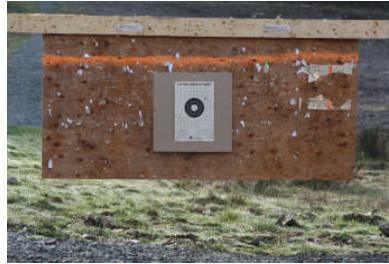
The Right Way