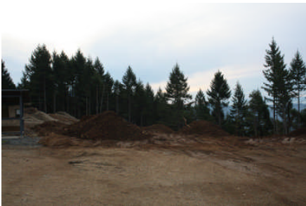
Back Filling the Multi-Purpose is going well !!