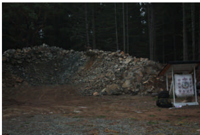
Rock Pile is getting smaller on the Archery Range