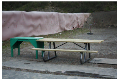
New Shooting Tables on the Multi-Purpose Range!