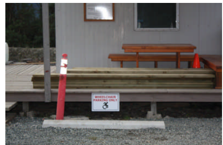
Please leave the Physically Challenged SPOTS for those that need them !!