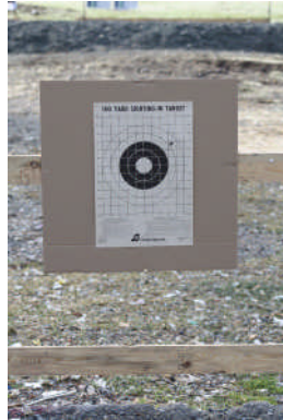
The Wrong Way