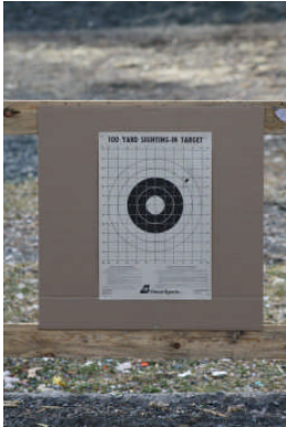
The Right Way

To prevent shooting out (destroying) the wood cross beams.