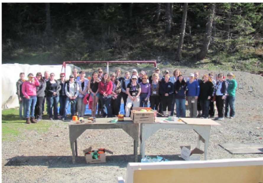
GROUP SHOT FROM THE VICTORIA WOMEN SHOOTERS APRIL SHOOTING EVENT