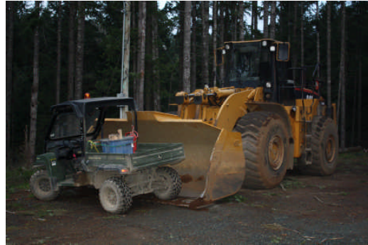
Construction Continues on the Archery Range! Wrong place TO PARK !!