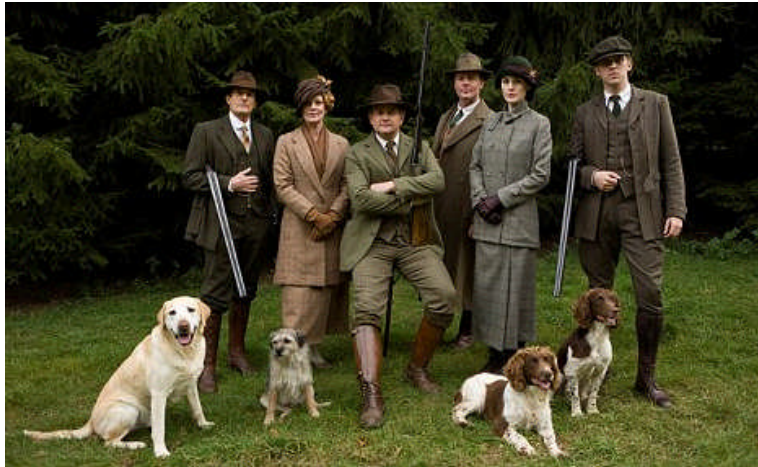
Downtown Abbey Christmas Special

There is a club of shooting enthusiasts on the east coast of the U.S. who call themselves the Vintagers Order of Edwardian Gunners . They love to shoot and promote interest in vintage double barrel shotguns and rifles. Attendees dress-up in period costume – Edwardian country gentlemen and gentlewomen, and in safari outfits.