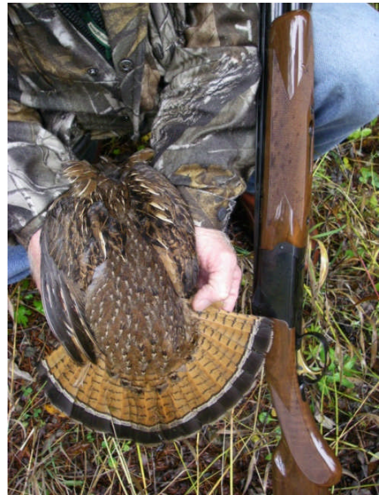
Ruffed grouse: left photo grey phase; right photo red phase.

For many new Vancouver Island hunters the first game they usually take is an upland game bird such as a grouse. Of the four species of grouse in the province, two are found on Vancouver Island – the Ruffed grouse and the Blue (Sooty) grouse. The Ruffed grouse is the most abundant of the grouse species found in British Columbia. Both males and females are mottled brown and can come in two different colour phases; red and grey (see above photos). One key distinguishing feature of the Ruffed grouse is it's fan shaped tail that has several thin, parallel black lines and always a single wide black band near the tip. (Incidentally, if the solid band is interrupted in the center two tail feathers, the bird is a female). Ruffed grouse also have an erectable crest on the top of their head and males have solid black 'ruff' patches on each side of their neck. In the spring, male Ruffed grouse drum on a log, a stump, or other 'stage' by beating their wings rapidly to attract a mate.