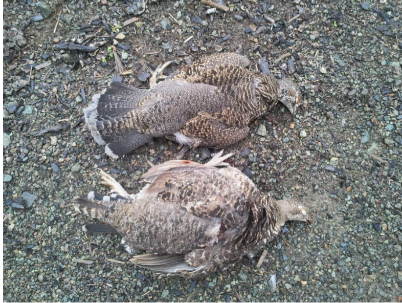
Pair of young Sooty (Blue) grouse.

Both species of grouse provide excellent table fare, however, the saying "you are what you eat" whole heartedly applies to grouse. As the hunting season progresses and food sources become more scarce, the dandelion shoots, berries and clover the grouse ate in the summertime are gradually replaced by deciduous buds and conifer needles of winter. Blue grouse in particular seem to get into the conifer needles quite early on in the hunting season. This switch in diet can impart a much stronger flavour to the grouse meat of which some hunters find unpalatable. One effective way of addressing this is to soak the grouse in milk (or salt water for those with a lactose intolerance) for 12-24 hours. Before you go to bed simply place the meat in a shallow container, cover with milk and refrigerate. The next evening remove the meat from the milk and cook as normal, being mindful that it is very easy to overcook grouse and end up with a tough dinner! I don't really know the science behind the milk trick but it works and it does an excellent job of drawing the stronger, 'later season' flavours out.