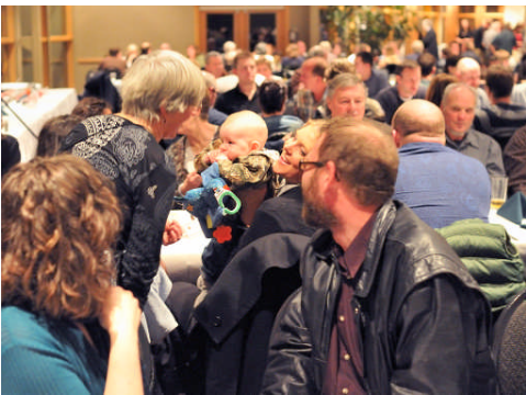
Even the very young enjoyed the dinner and the company!!