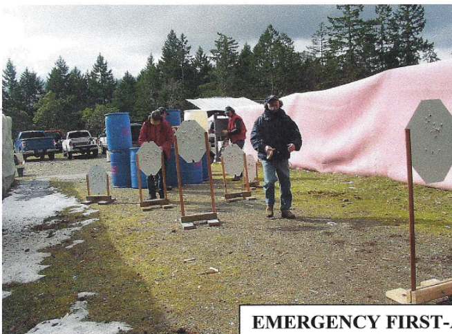
EMERGENCY FIRST-AID & RESCUSITATION FOR WOUNDED TARGETS