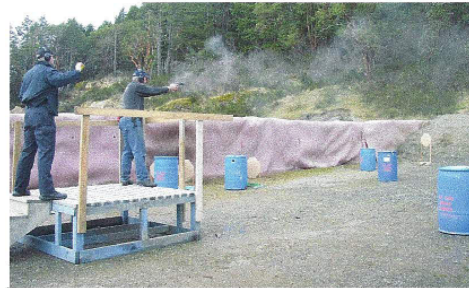
SMOG MACHINE WITH A KICK