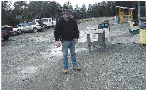
SERIOUS TARGET THREAT SIGHTING

Even the weatherman - uncharacteristically – cooperated. Given the recent conditions we've been enduring, all set-up and match participants could hardly believe that we were blessed with two good days in a row.