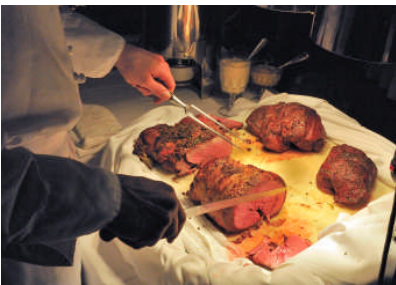
Perfectly prepared meats.....