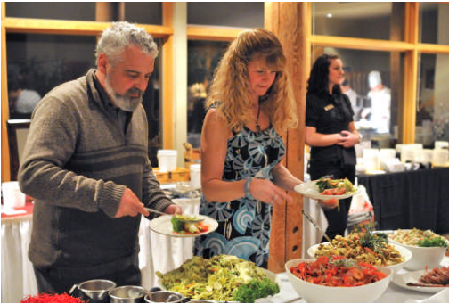
Enjoying the salad bar choices....