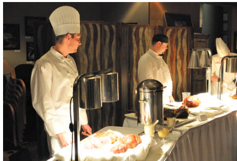
Our Chef meat carvers before the rush....