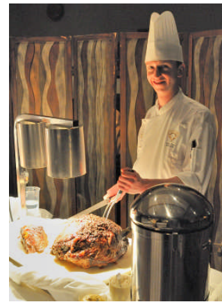
The Roast Beef Carver Before the rush.....