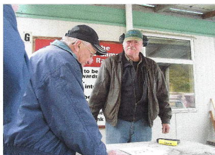
SOME OF THE TECHNICAL CREW